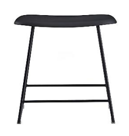
NS-B-45 Black Dimensions: 42cm W X 42cm D X 45cm H Seat 45cm H